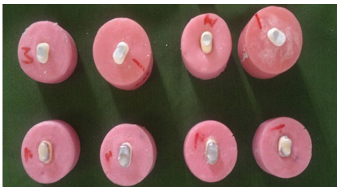
[Table/Fig-1]: Teeth mounted in acrylic resin blocks

contained 20 teeth, except Group A which contained 10 teeth. All the teeth were subjected to free hand preparation by a single operator with 1mm chamfer.